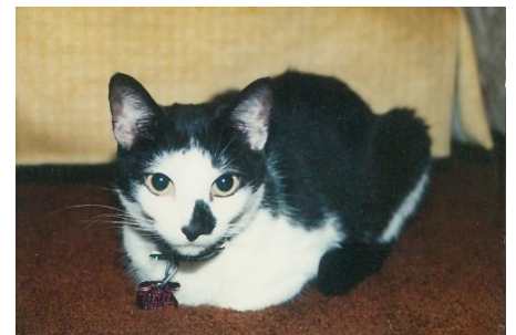
Spotte Narduzzi Cannon 1989-2009

I know that wherever she is, she is having a great time reuniting with Kitty, meeting Urnie, and cuddling in for a long sleep to wait for me.